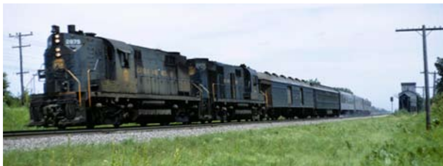
Ex-NKP RS36's approach the Lake Decatur bridge at Sangamon, Ill., with No. 301 in fall '67.