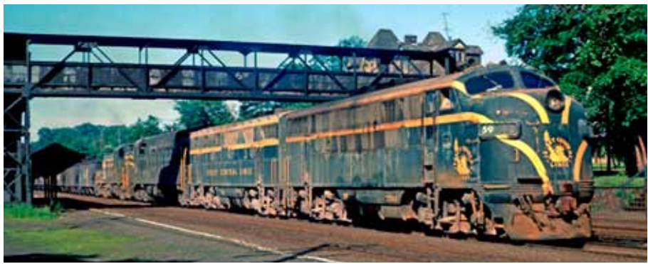
A "we ain't mad at nobody" diesel consist of F3A/F3B/H24-66/RS3 (that's EMD's, an FM Train Master, and an Alco) rolls eastbound freight through Fanwood-Scotch Plains, N.J., in the '60s.

ing & Lake Erie, and Pittsburgh & West Virginia replacing B&O.