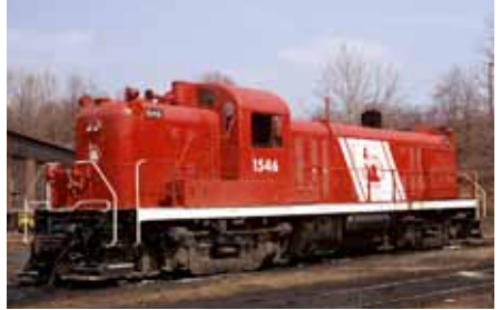
CNJ's final diesel livery was this nice red and white, exemplified by RS3 1546 in March '72.

Central Railroad of Pennsylvania was established in 1946 in a vain effort to shield Pennsylvania assets from heavy New Jersey taxation; it was dis-